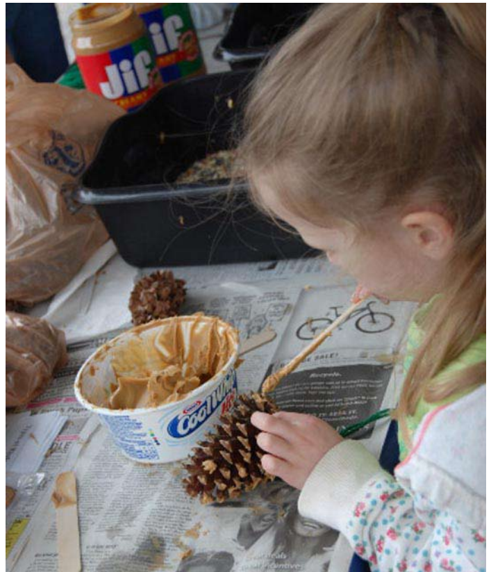
More than 50 volunteers coordinated activities at the May 14, 2011, Queen City Bird Festival at Hueston Woods. Above, a child makes a feeder from a pine cone. Kids could also play nature-related games such as "name that bird," make masks, and learn bird identification. See more in the AMV Newsletter e-mail only E-Extra edition.